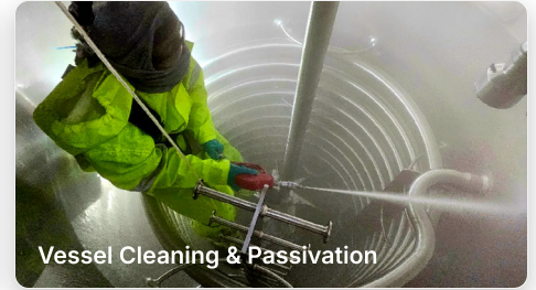
Vessel Cleaning & Passivation