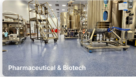
Pharmaceutical & Biotech