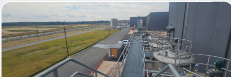
Toyota Battery Mfg - NC Direct Recirculation Lines Commissioning