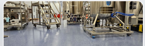
Amgen - Holly Springs, NC Complete Facility Commissioning