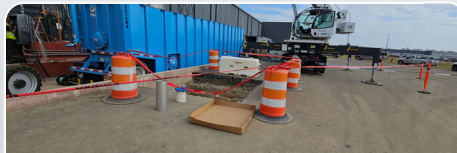
PMI @ Toyota - Building 804 Full System Commissioning