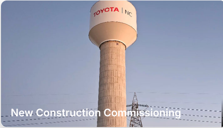
New Construction Commissioning

HIGH-PURITY SYSTEM COMMISSIONING • NEW CONSTRUCTION SPECIALIST